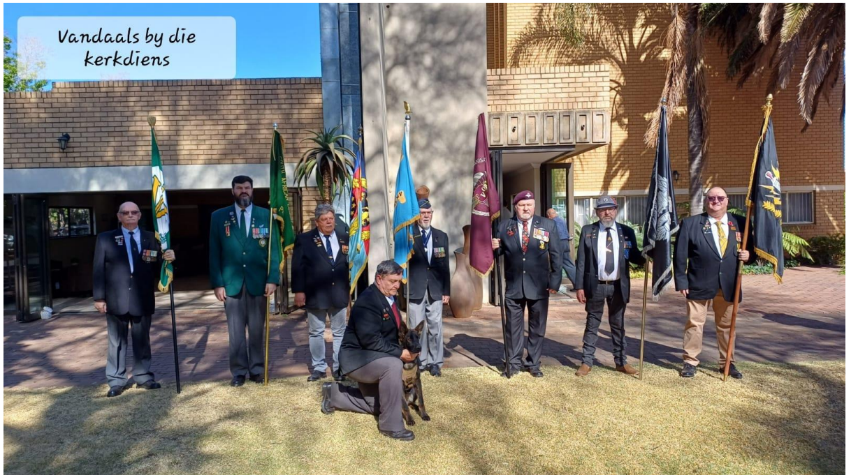
Scenes from the Annual International Day of Peace Church Service held at the NG Kerk Raslow in Centurion.