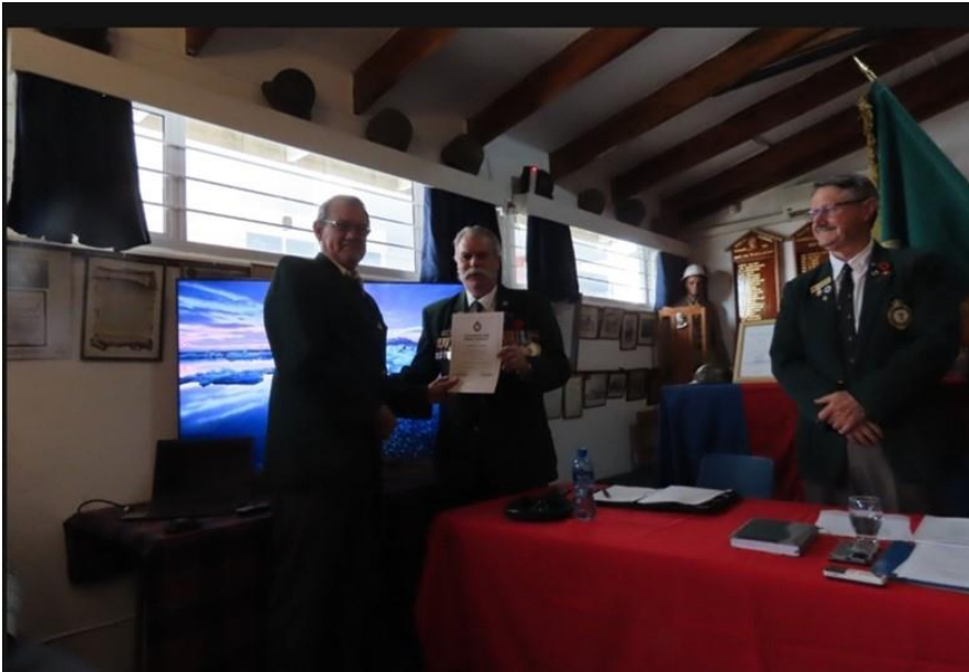
Scenes from the Annual General Meeting of the Durban Branch.