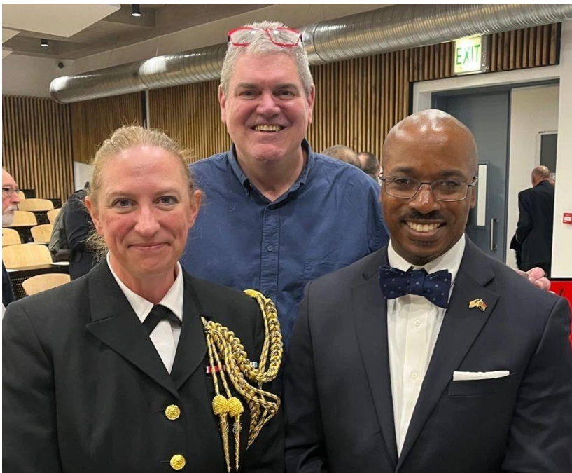
Scenes from the rededicating and reinvigorating of Sailor' Malan.