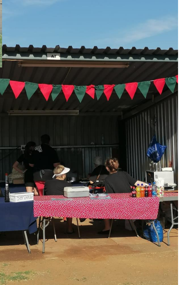
Scenes from the Bloemfontein Familie Trekker Fees.