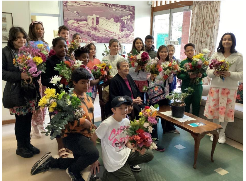
Photo right: Learners from the Forres Preparatory School during their visit to Rosedale on Spring Day.