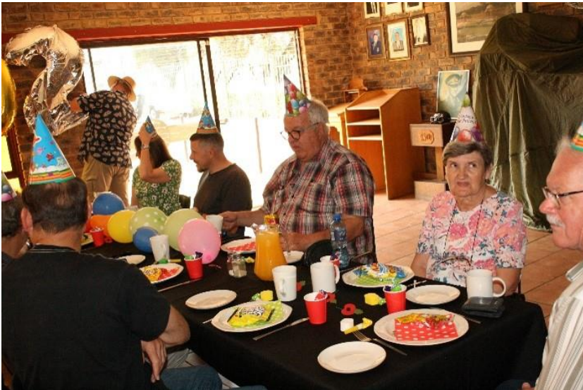
Scenes from the Pretoria Branch's 102 nd birthday brunch.