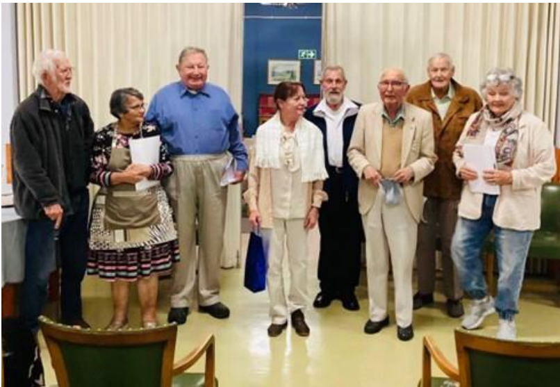
In the photos left and below are scenes from the play reading at Rosedale.