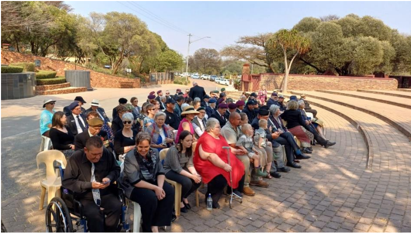
Scenes from the Annual Operation Savannah Memorial Service.