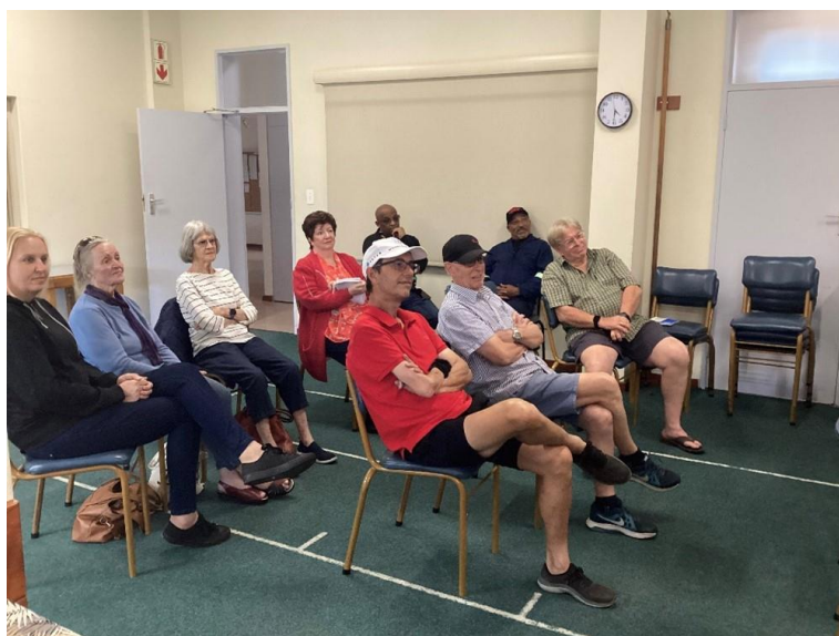
Photo left: Intrepid walkers listening to the briefing on the Poppy Day walk.