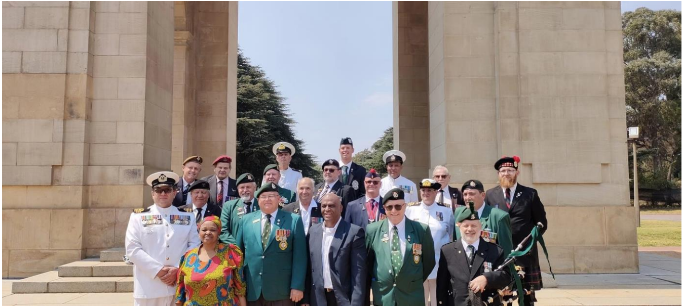
Some of the attendees at the Annual Battle of Square Hill Memorial Service at the Ditsong Museum of Military History, Johannesburg.