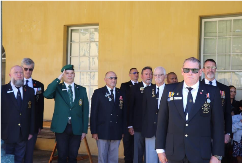
Scenes from the Annual Battle of El Alamein Memorial Service held at the Castle of Good Hope in Cape Town.