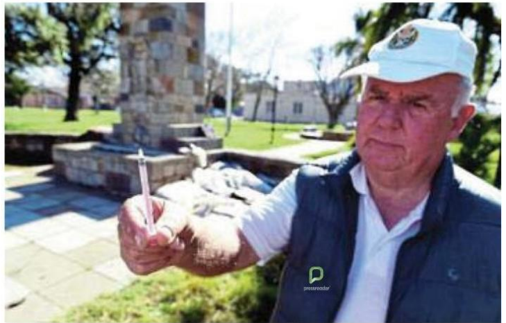
Scenes from the Walmer Cenotaph repairs.