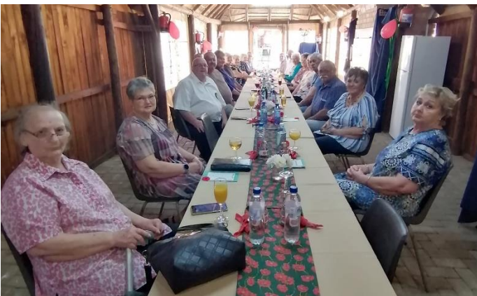
Scenes from the Bloemfontein Branch morning tea.