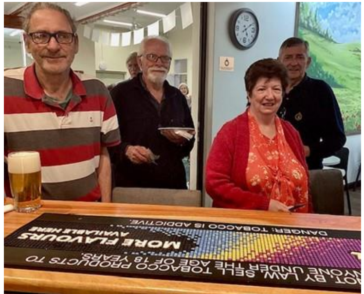
Photo right: Some of the intrepid walkers enjoying refreshments following the briefing on the Poppy Day walk.