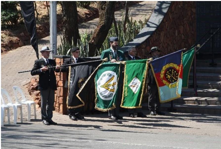
Scenes from the Technical Services Veterans Memorial Service.