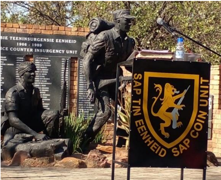
Scenes from the Annual South African Police Counter Insurgency Unit (SAP COIN) Veterans Memorial Service.