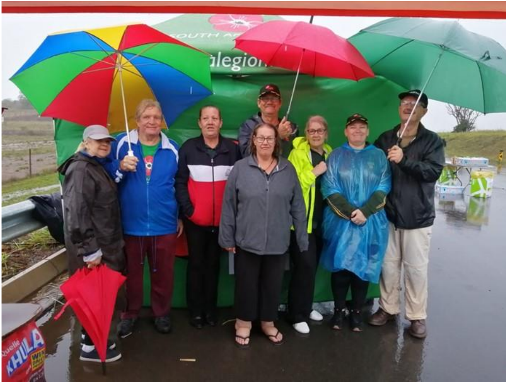
Photo left: Members from the Durban Branch that manned the water point at Camperdown during the Amashova race.