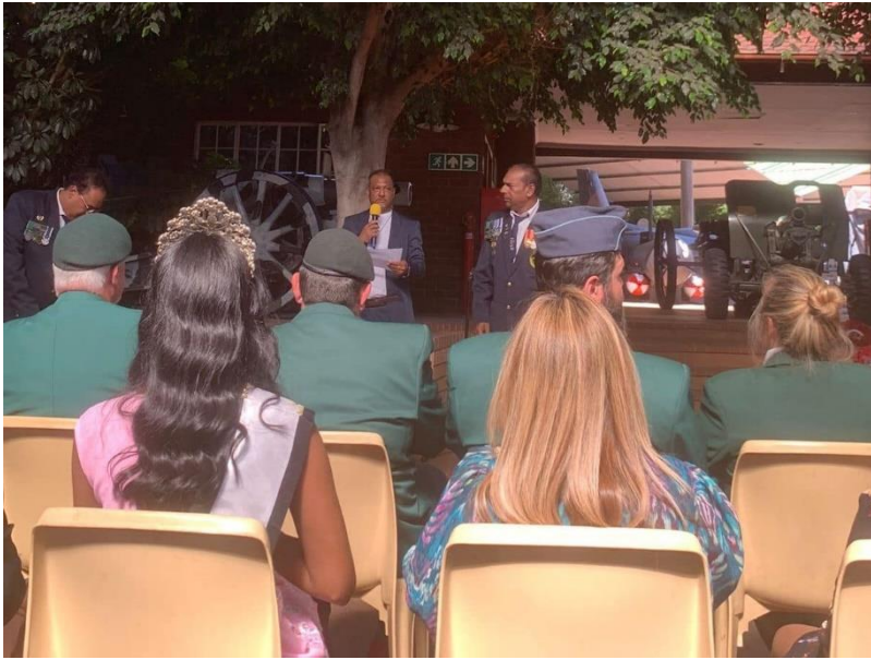
Scenes from the Annual South African Indian Legion Memorial Service in Johannesburg.