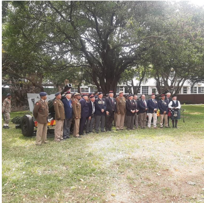
Scenes from the Annual Gunners Memorial Service in Durban.