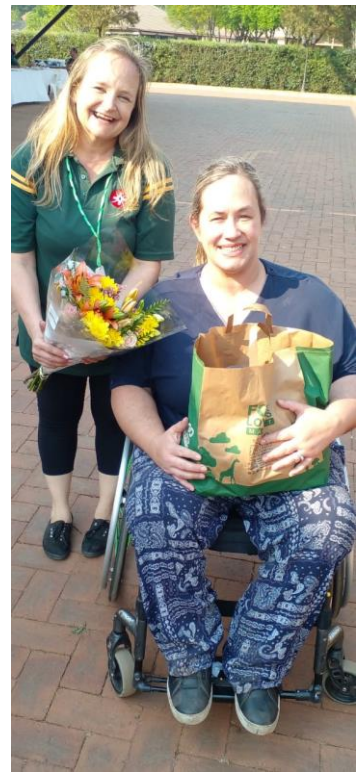
Scenes from the Ramcat Fishing Competition that took place at the Irene Country Club in Centurion.