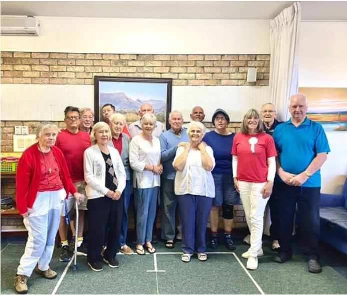
Photo left: Participants in the Carpet Bowls at the Pinelands Place.