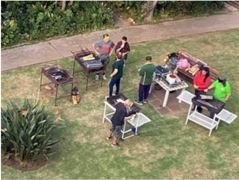
Scenes from the Rosedale Snoek braai.