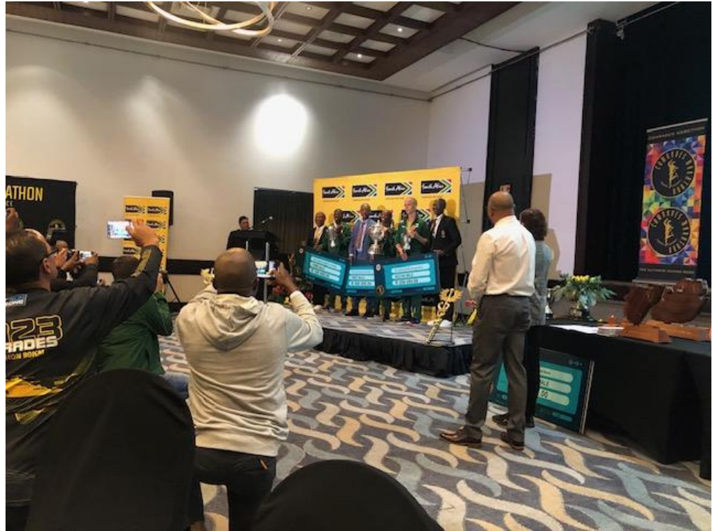
Right: All the Women's Winners on the podium.