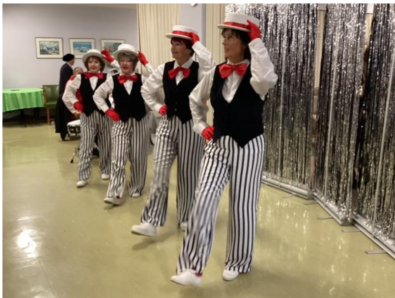
Right: Here, a troupe of lively dancers kick up their heels and strut their stuff to melodies from days gone by.