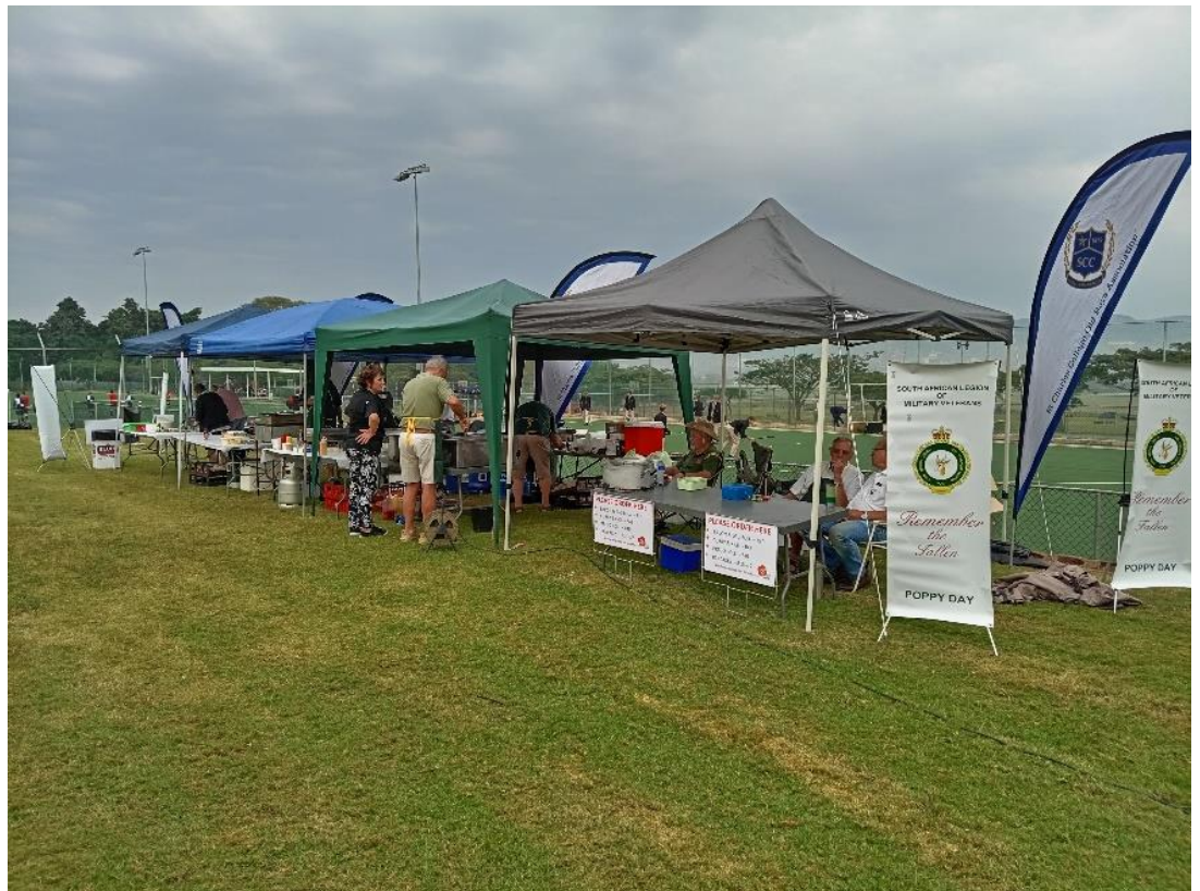
Above: The Pietermaritzburg Branch stand during the fundraising.