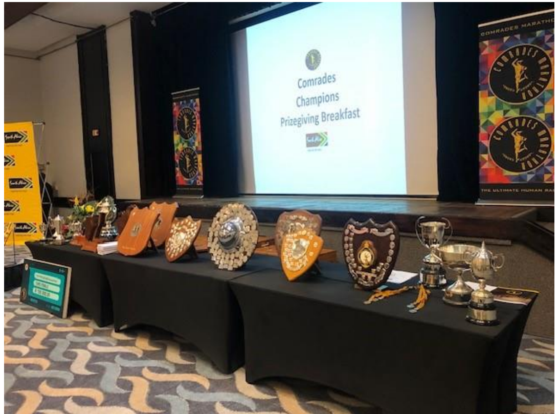
The trophy table at the prizegiving of the 2023 Comrades Marathon. The Legion Shield is clearly visible on the right of the table.