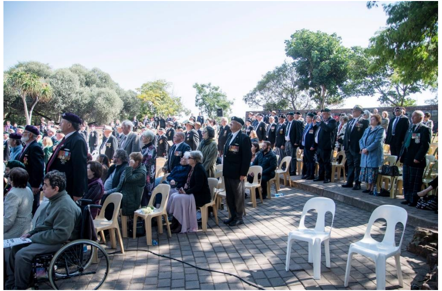
Right: Attendees at the Annual CMVO Memorial Service at the SANDF Wall of Remembrance.