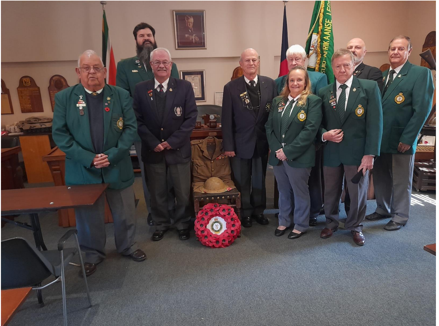
Attendees to the Annual General Meeting of the Pretoria Branch.