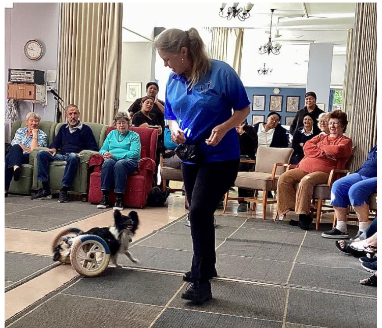
Right: This miniature sheepdog was mauled by another dog resulting in a broken back. Not to be outdone, he gets around with the aid of a wheeler and proudly strutted its stuff for the appreciative audience.