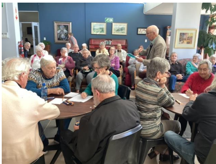
Right: Questions were challenging and had the teams digging deep into their mental think-tanks.