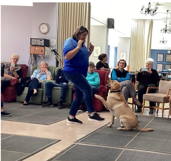
Left: They make it look so easy, but it takes hours and months of jolly hard work to prise this kind of behaviour out of these four-footed friends.