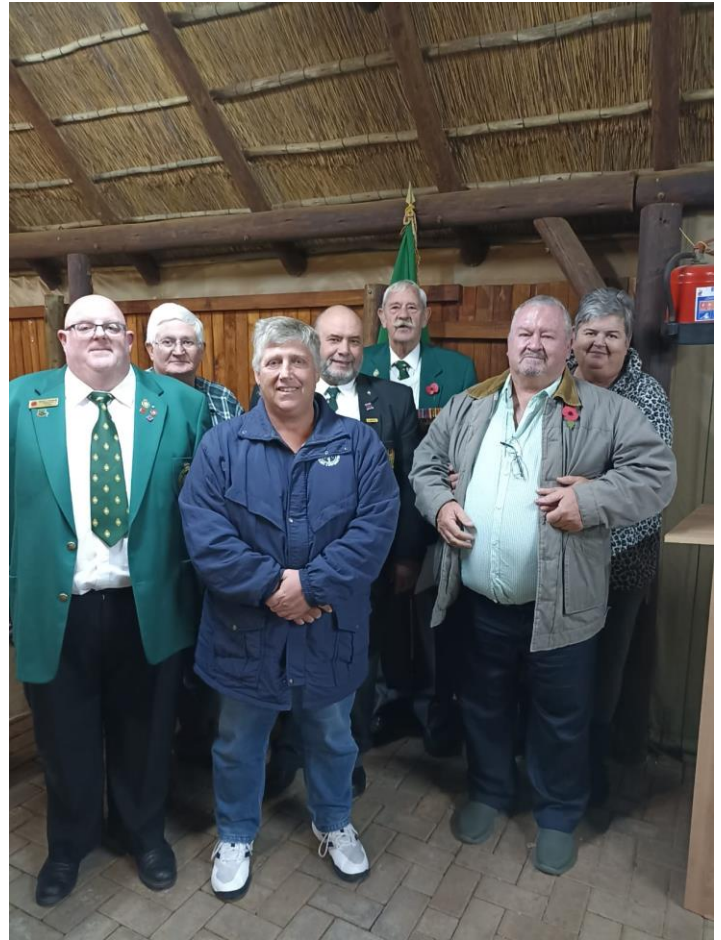
Right: Newly elected members of the Bloemfontein Branch Committee.