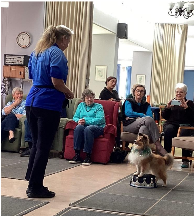
Left: The Dancing Dogs handlers put their charges through their paces at Rosedale on 2 May.