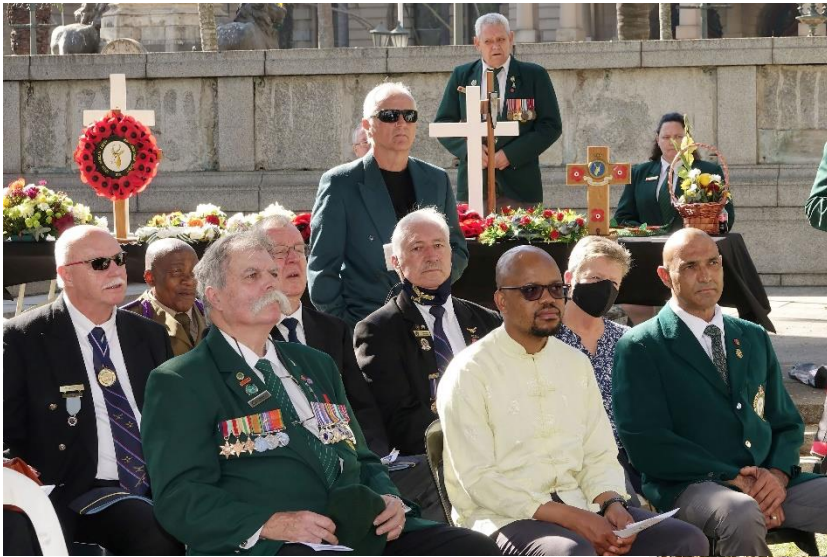
Attendees to the Battle of Delville Wood Commemoration Service, Durban.