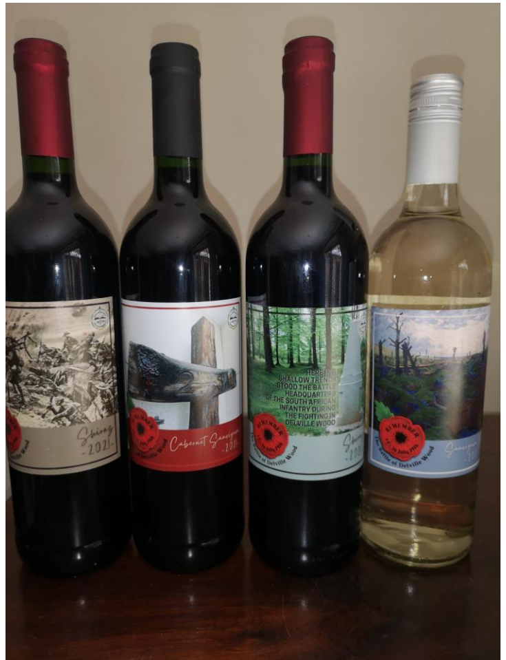
Delville Wood wine that were sold after the Battle of Delville Wood Commemoration Service as part of the fund raising for the Johannesburg – Central Witwatersrand Branch.