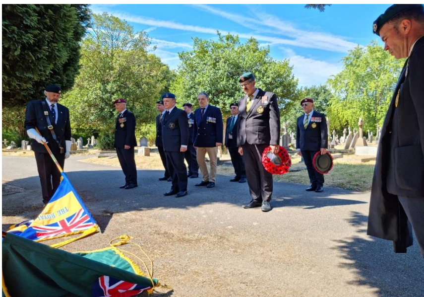
Sounding of the Last Post prior the laying of wreaths at the South African Cenotaph, Richmond, The United Kingdom during the Battle of Delville Wood Commemoration Service.