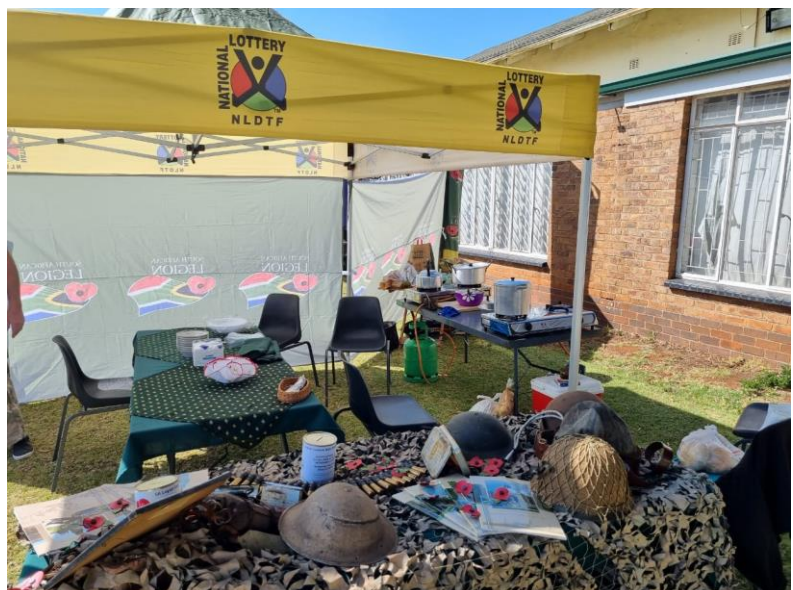
The stand of the Johannesburg – Central Witwatersrand Branch at the UAV soup competition.