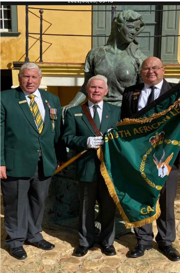
Members of the Johannesburg – Central Witwatersrand Branch at Rosedale Cape Town office.