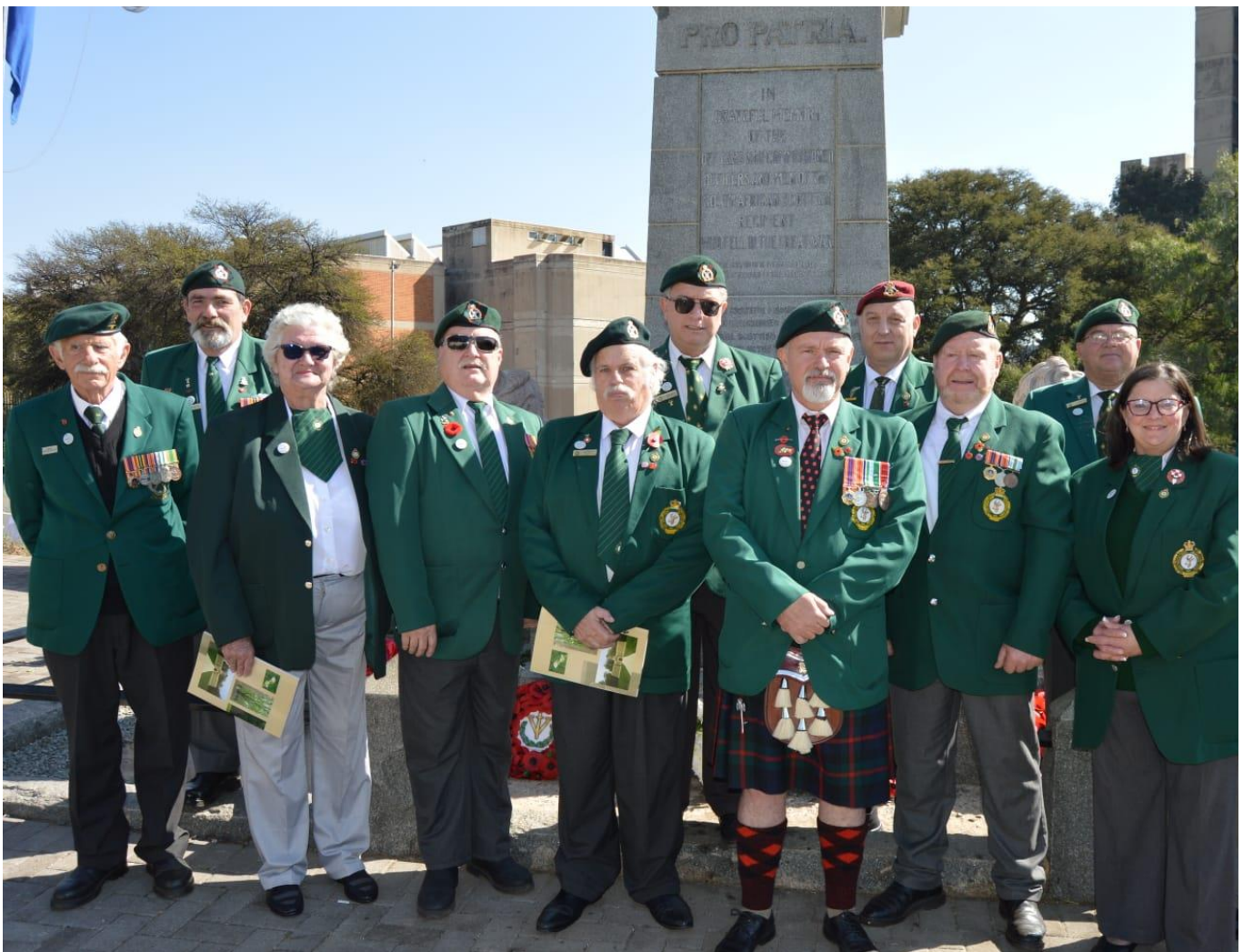
MEMBERS OF THE JOHANNESBURG – CENTRAL WITWATERSRAND BRANCH THAT ATTENDED THE BATTLE OF DELVILLE WOOD COMMEMORATION SERVICE AT THE SCOTTISH MEMORIAL OUTSIDE THE VIEW IN JOHANNESBURG ON 17 JULY 2022