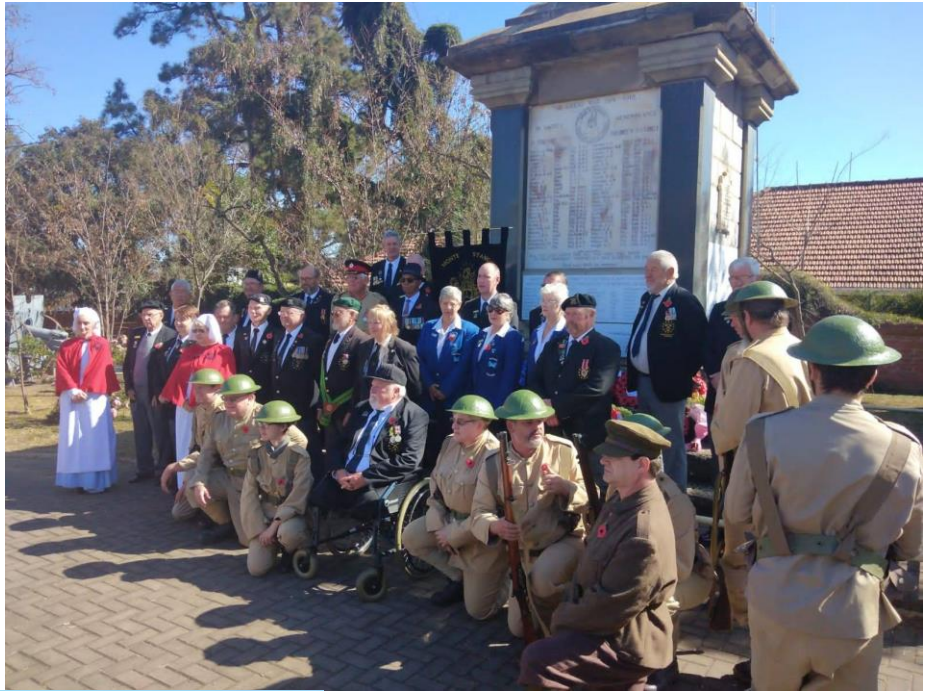
Attendees at the Battle of Delville Wood Commemoration Service at Talana, Dundee.