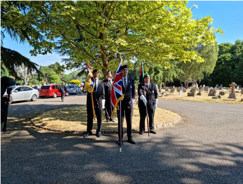
Standard bearers formed up prior to the commencing of the Battle of Delville Wood Commemoration Service in Richmond, The United Kingdom.