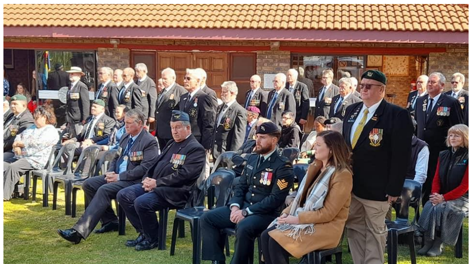
Attendees at the Battle of Delville Wood Commemoration Service in Pretoria.