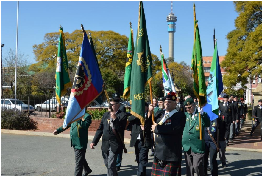
Veterans marching to the Scottish Memorial for the Battle of Delville Wood Commemoration Service in Johannesburg.