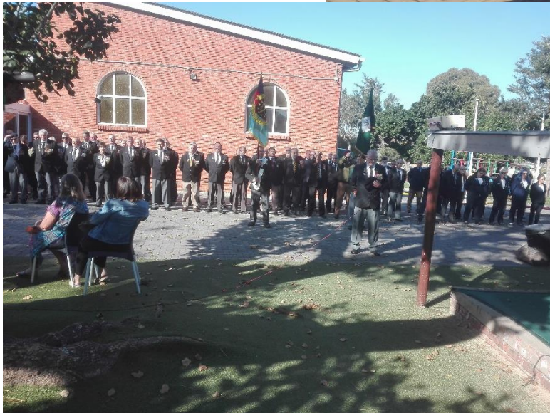
Veterans on parade at the Battle of Delville Wood Commemoration Service in Port Elizabeth.