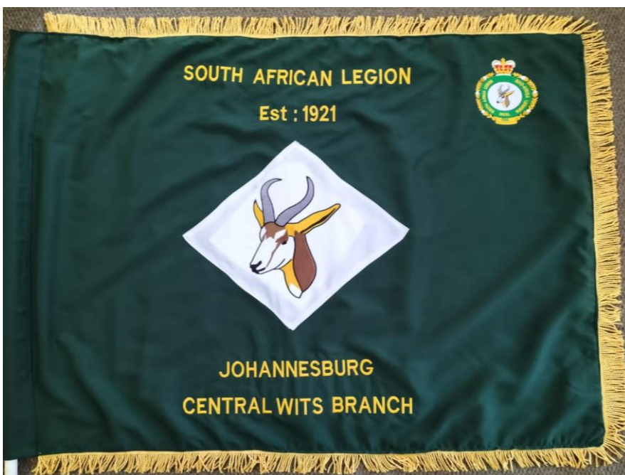
The new Johannesburg – Central Witwatersrand Branch standard.