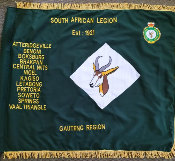
The new Standard of the Gauteng Region.