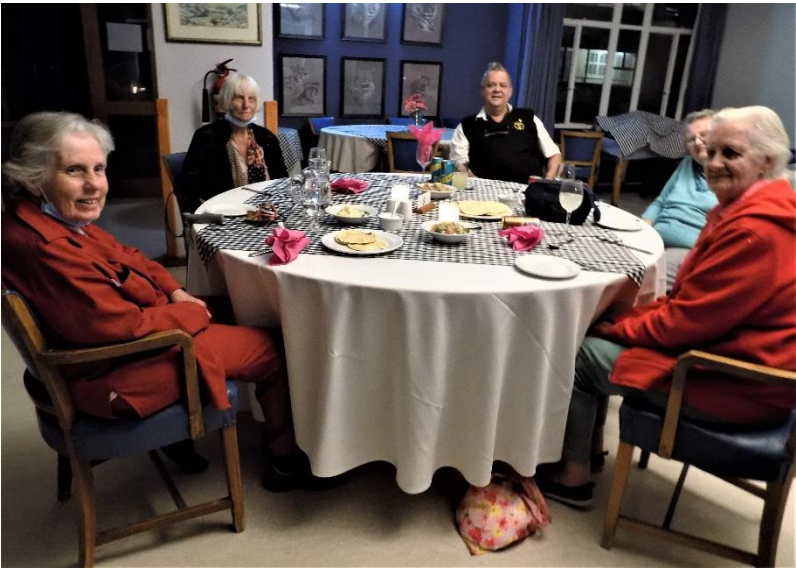
Members of Rosedale that donned their rags for the currie and rice.