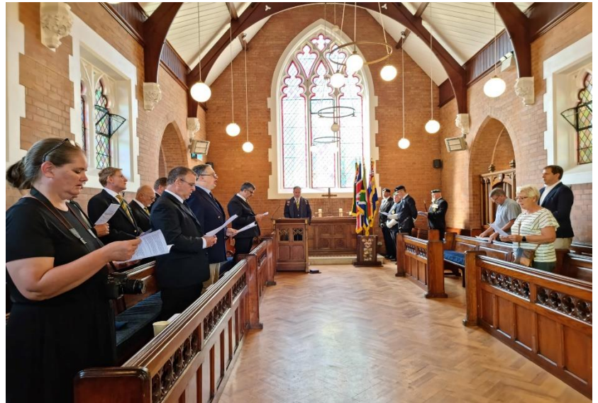
Attendees in the Chapel during the Battle of Delville Wood Commemoration Service at Richmond, The United Kingdom.