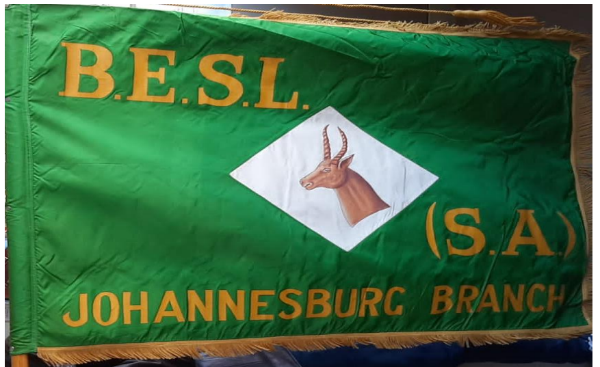
The lost Johannesburg Standard.