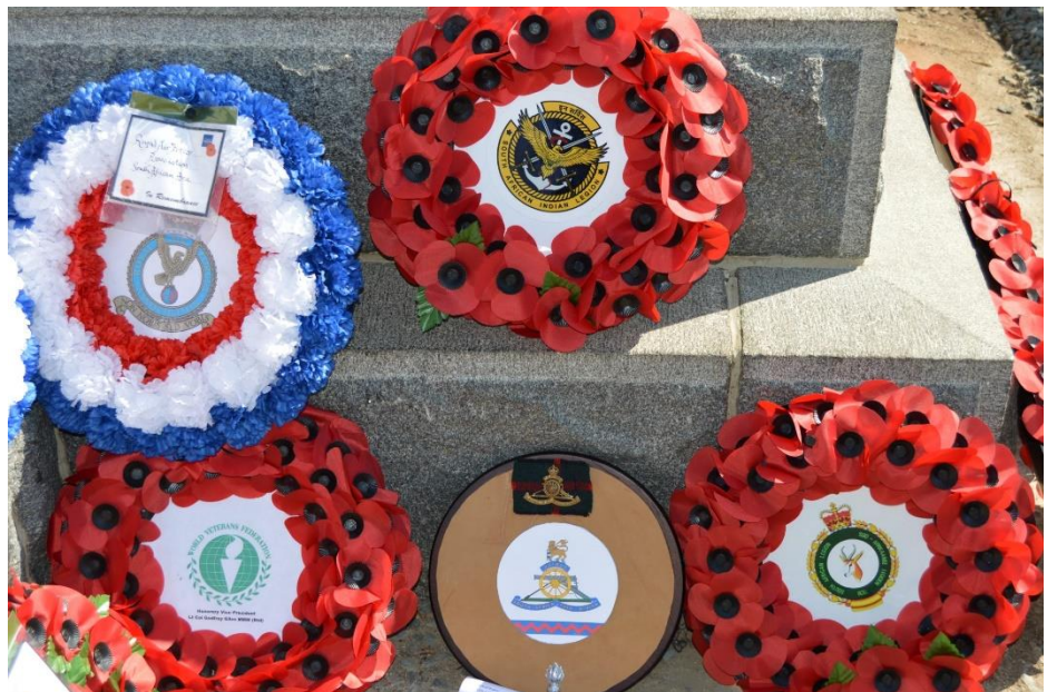
Some of the wreaths that were laid during the Battle of Delville Wood Commemoration Service at the Scottish Memorial, Johannesburg.