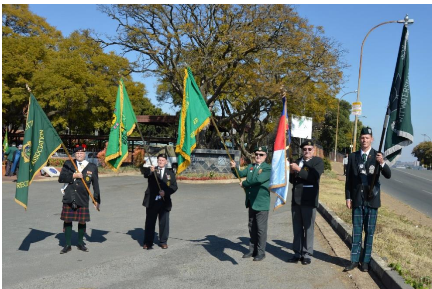
Some of the standard bearers that attended the Battle of Delville Wood Commemoration Service at the Scottish Memorial, Johannesburg.