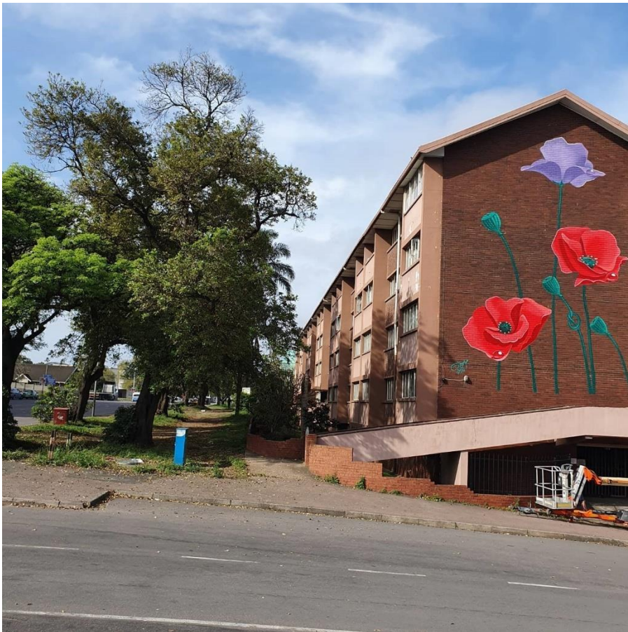
B.E. S. L. Court Lot 542E Umbilo of the Townlands of Durban No. 173 (3 027 square metres), 839 Umbilo Road, Durban.