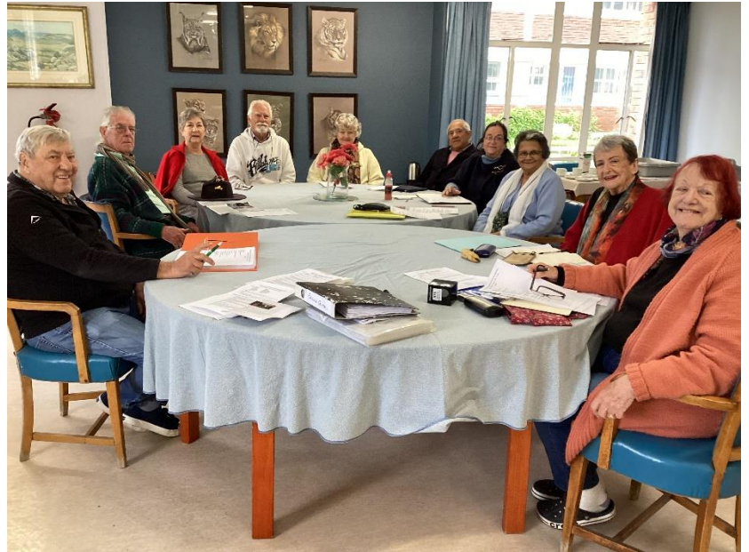
Members of the newly elected Rosedale Service Centre committee.