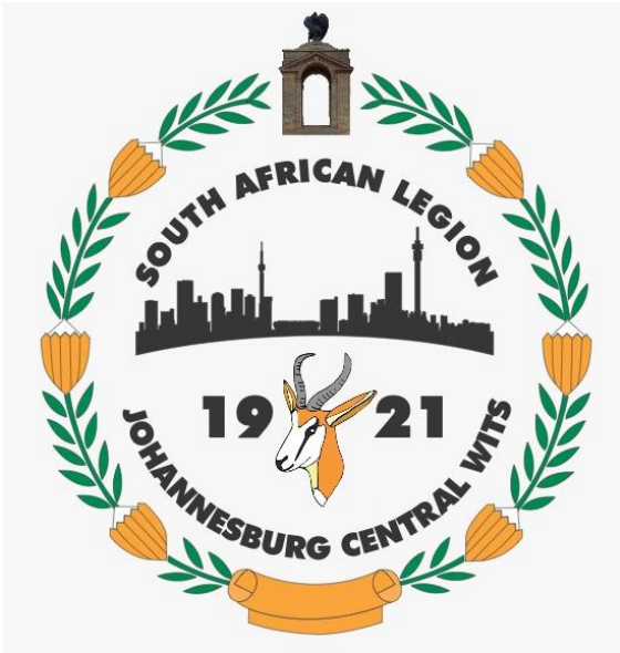
The new branch badge of the Johannesburg – Central Witwatersrand Branch.