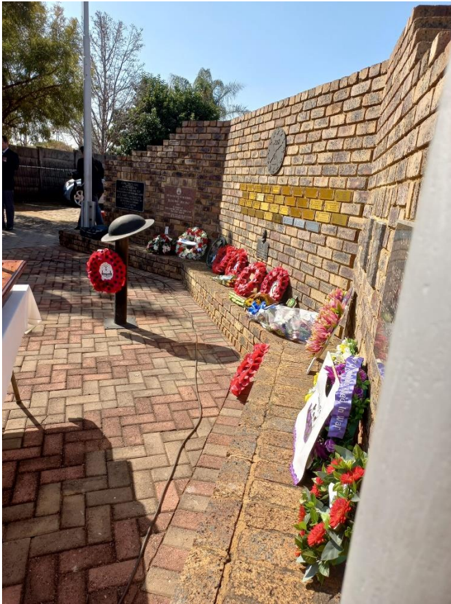
Wreaths laid during the Battle of Delville Wood Commemoration Service in Pretoria.