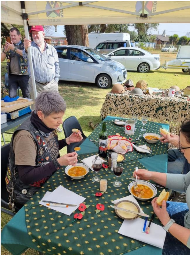
The judges tasting the soup prepared by the Johannesburg – Central Witwatersrand Branch team during the UAV soup competition.