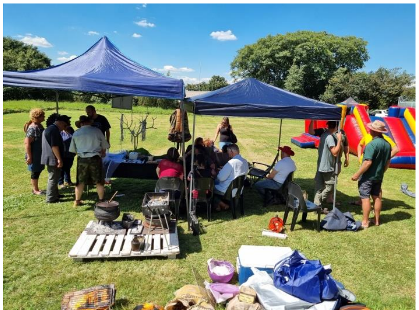
The Johannesburg – Central Witwatersrand Branch team waiting for the judges during the potjie competition.