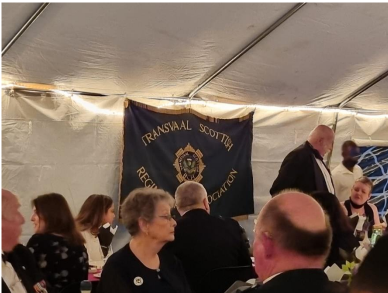
A scene from the Transvaal Scottish Association Lunch.