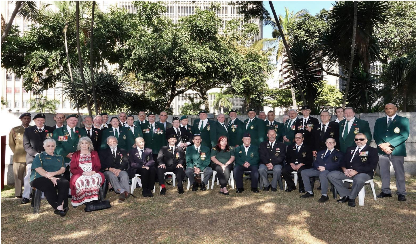
A group photo of the attendees to the Battle of Delville Wood Commemoration Service in Durban.